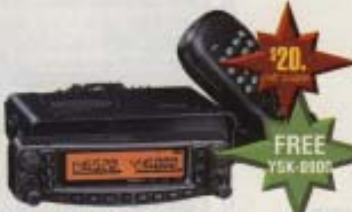
FT-8800R 2M/440 Mobile