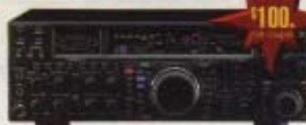
FT-2000/FT2000D HF + 6M tcvr