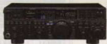
FT-950 HF + 6M TCVR