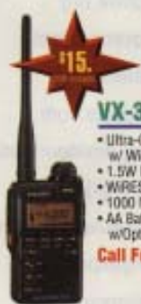
VX-3R 2M/440 HT