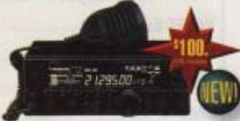
FT-450AT HF + 6M TCVR