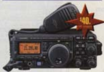
FT-897D VHF/UHF/HF Transceiver