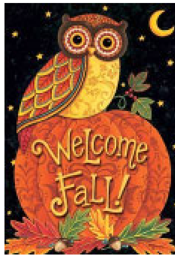
First Day of Fall September 22nd