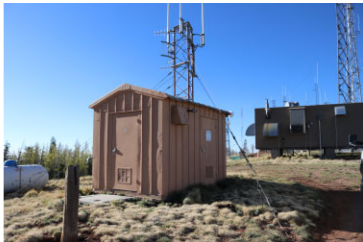
Continued Next Column