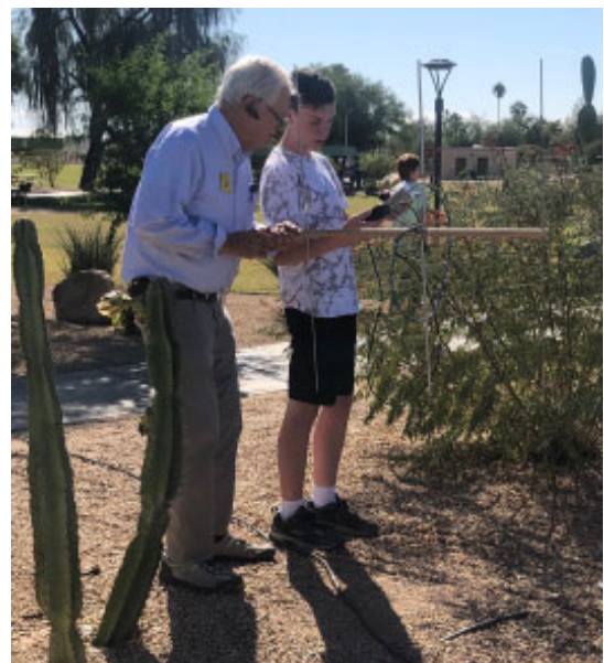
Fox hunting in the park