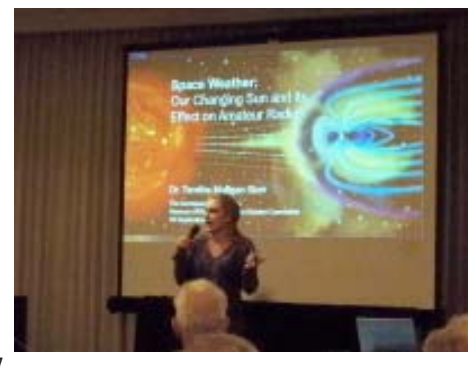
Space Weather Presentation