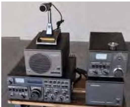
The donated station. A TS-180s radio, speaker, microphone, power supply and antenna tuner.