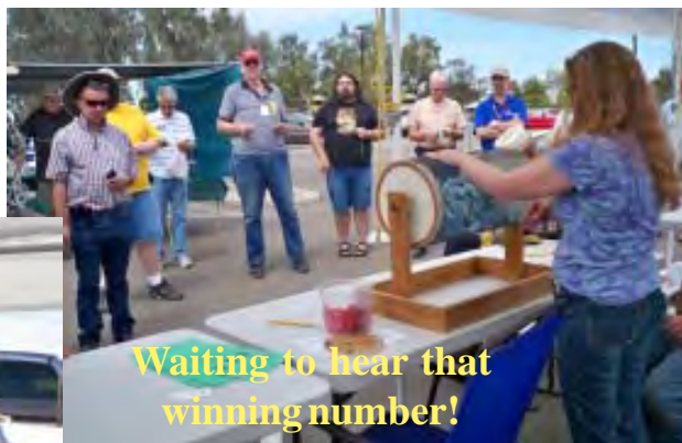
Waiting to hear that winning number!