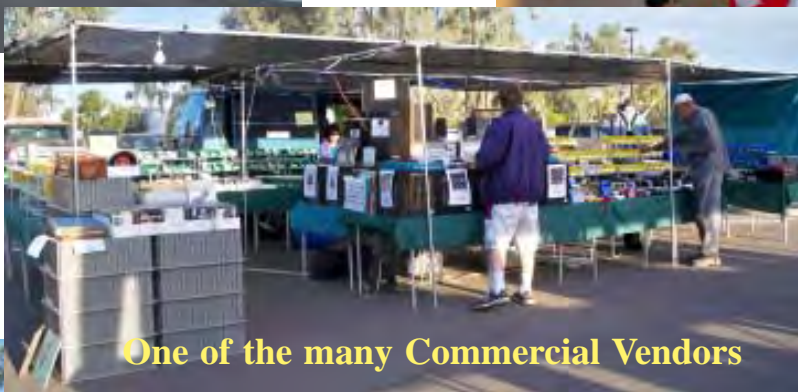
One of the many Commercial Vendors