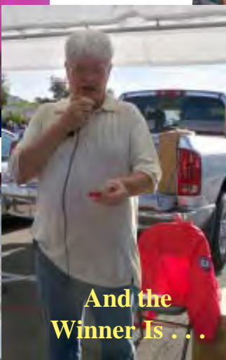
And the Winner Is . . .