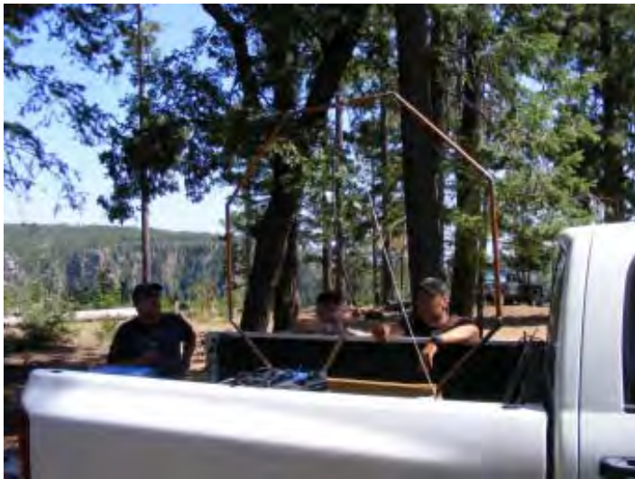
Kurt, KE7KUS, explains the construction of a magnetic loop antenna as part of a Field Day antenna workshop during 4x4 Ham’s 2012 Field Day

You never know what amateur radio niches will show up at a 4x4 Ham Field Day site. In the past, in addition to the traditional HF SSB contacts, we’ve had operators working CW, digital modes, and even amateur satellites. Many operators also bring along projects associated with their current amateur radio interest area, which makes for some great “show & tell” sessions.