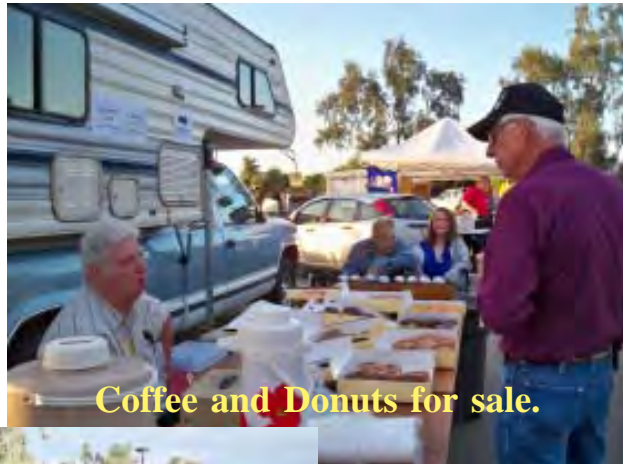
Coffee and Donuts for sale.