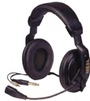
3 rd Prize: Heil Boom Headset HLS-PSM

Many other prizes include: Two Wouxun Dual-Banders, Power Pole Crimping Tool, RigRunner 4005, Station Clocks, Coax Tool Kit, Emergency Flashlights, etc.