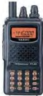
2 nd Prize: Yaesu FT-60R