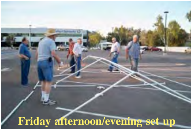
Friday afternoon/evening set up