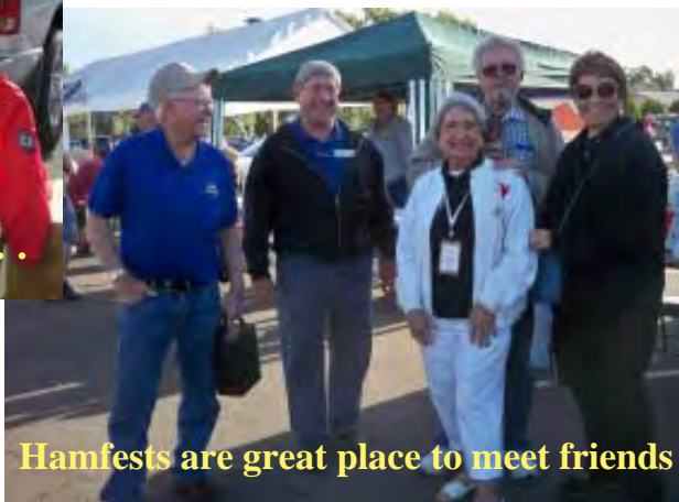
Hamfests are great place to meet friends