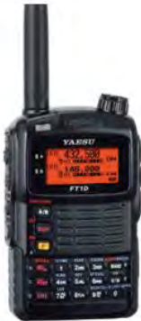
1 st Prize: Yaesu NEW FUSION DIGITAL FT1-DR