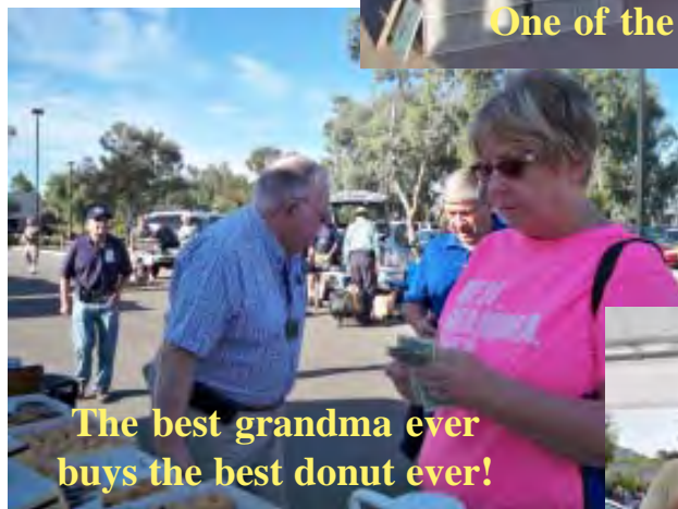
The best grandma ever buys the best donut ever!