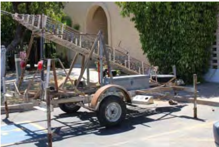
W7IO Tower and Generator Trailer