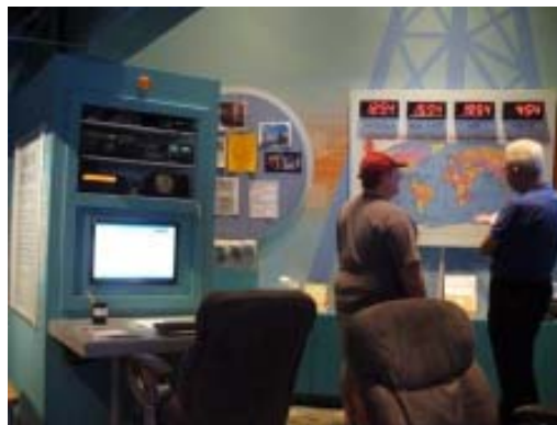
The W7ASC Shack

Here is the new QRZ entry for the W7ASC station at the Arizona Science Center. We even have one of our volunteer operators in the 3rd floor hall mural for "My Digital World."