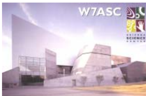
The W7ASC QSL Card