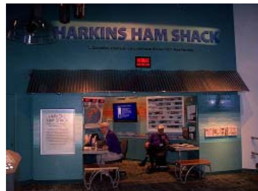
The W7ASC Shack