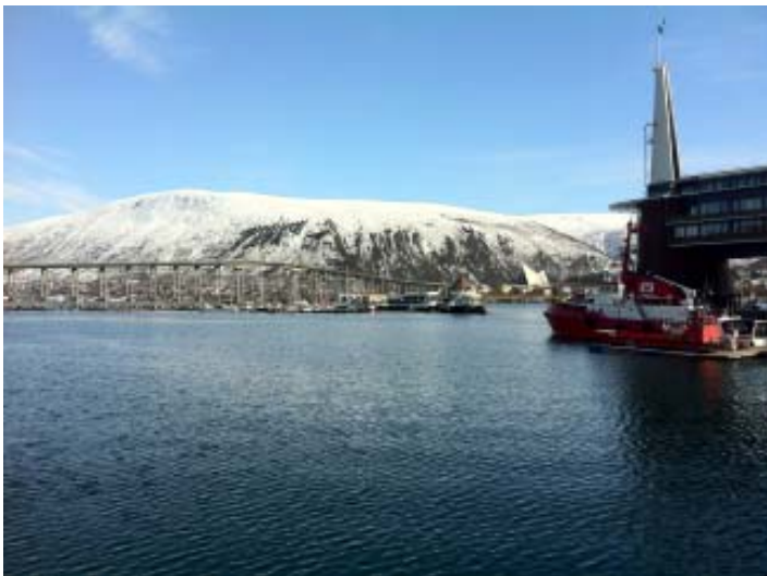
LA/W7BV operated May 6-10 from Tromsø, Norway with this view from the hotel window.

Jim Pierce, N7QVW - 623.551.1204 - jim@n7qv.net Brian McCarthy, N7TUQ - 623.486.0507 - n7tuq@arrl.net