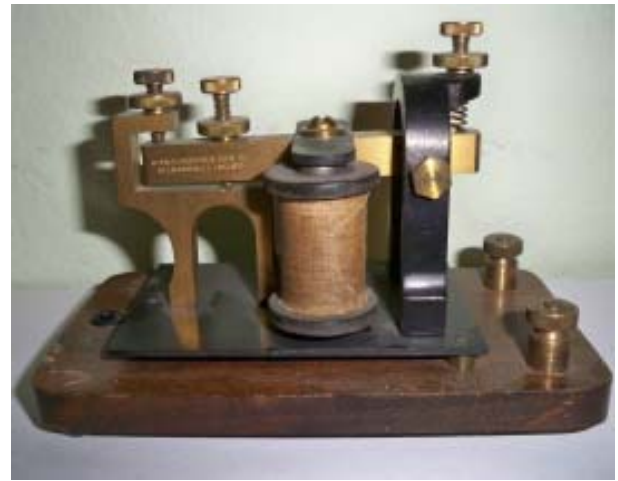
Antique Telegraph Souder from Signal Electric Mfg Co.