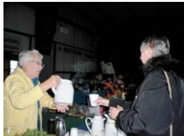
Volunteers provide coffee and cookies