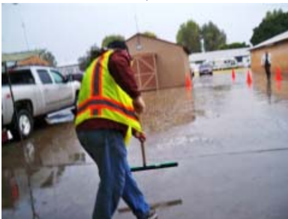
Clearing out the rain water