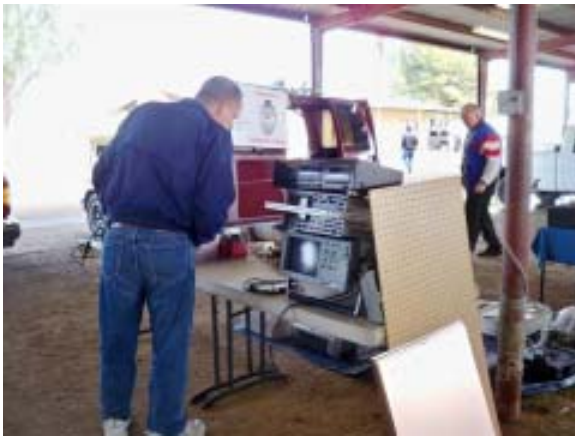
Tailgating under cover