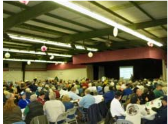
The Buzzard BBQ dinner