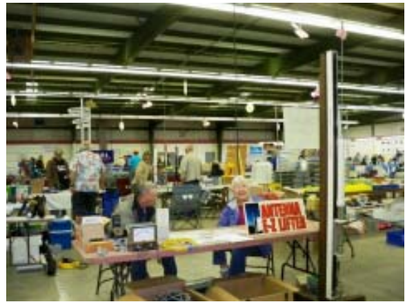
Main Hall Vendors