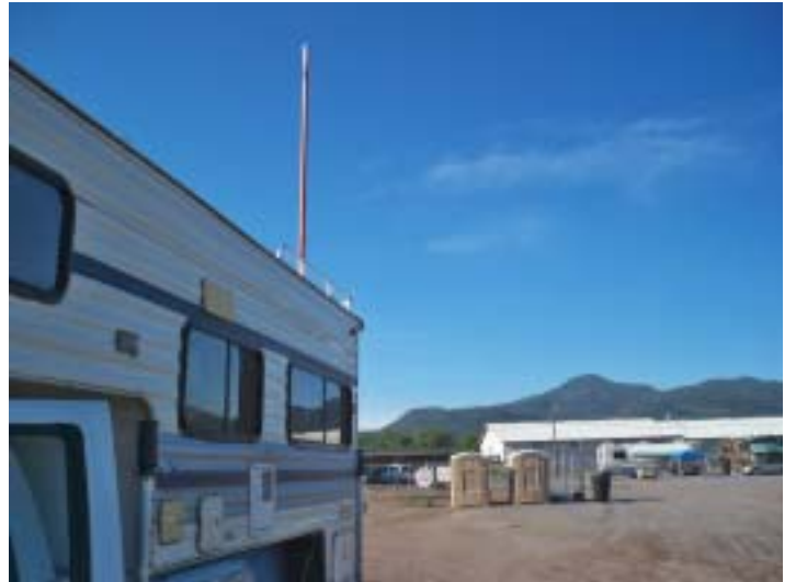
A partial view of Gary Hamman's completed dipole