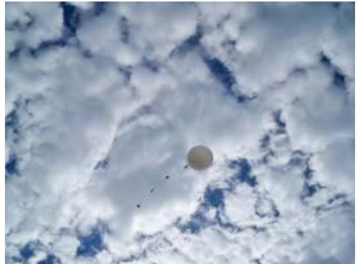
Balloon Up and Away