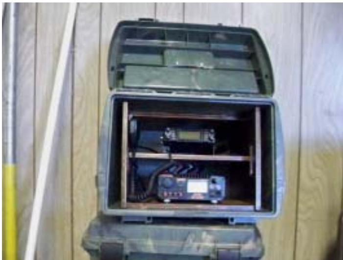
A typical example of the deployment kit ready to use