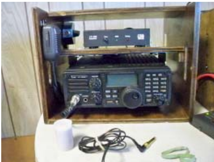
Front view of a deployment kit using an ICOM 7200 set up