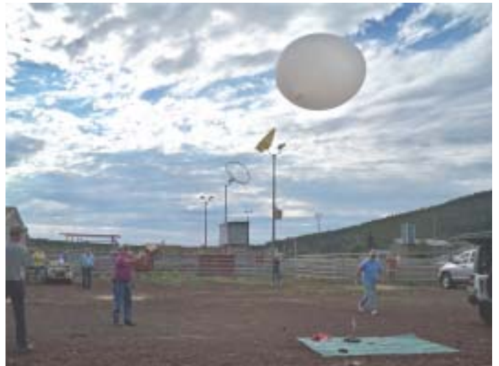
The Arizona Near Space Research balloon launch